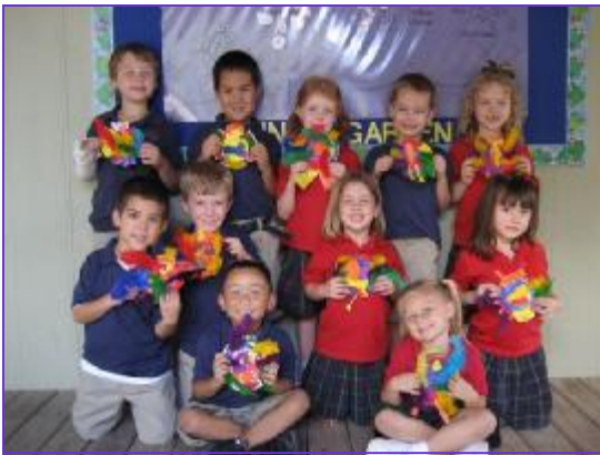
Mrs. Gregg's Class with lions from Africa

We continue to practice our penmanship daily, as well as, working with calendars, building patterns and reading graphs. The children come to school excited every day and ready to learn. They are a blessing to teach!