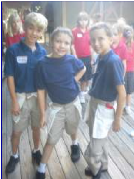
Wednesday—Backwards & Inside Out Day!