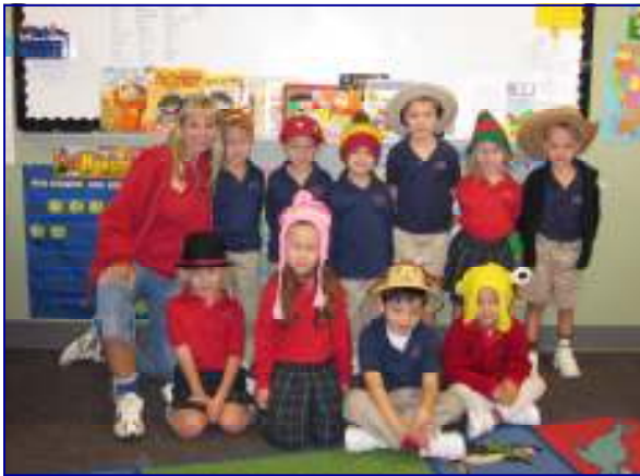
Tuesday—Crazy Hat & Sock Day!